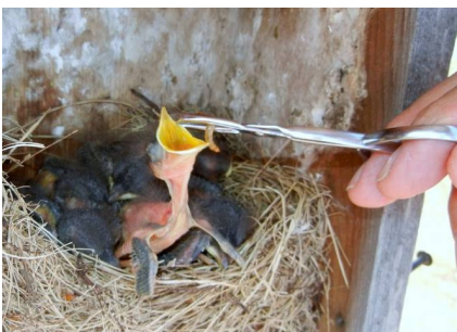
Feeding Tiny with tweezers.

Kensico and the adults immediately took advantage of the free food. I hand fed "Tiny" with tweezers.