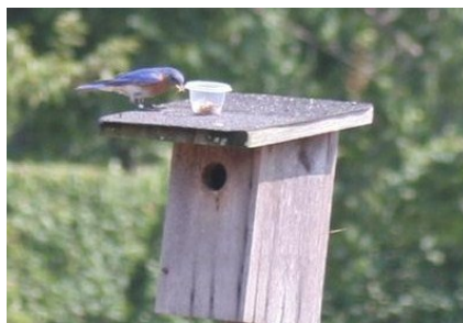
Cup with mealworms.