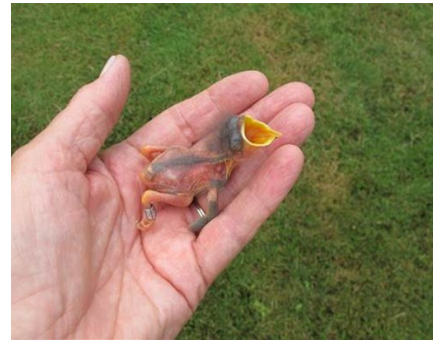
This baby was clearly starving.

With trepidation, I went back the next day. All were alive, but some of the nestlings in the Kensico boxes were begging for food and the runt was begging non-stop. Had I done the right thing?