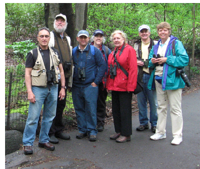
These early-birders caught all the warblers.

As we left the park several of us were discussing how lucky we are to live so close to so many great areas to watch birds.