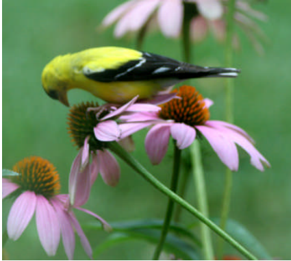
Grow seed-producing plants like purple coneflower to attract a variety of birds.

Birdscaping is the combo of America's two top hobbies, gardening and wild bird feeding. There is nothing like putting up a tube or suet feeder and watching beautiful songbirds enjoy a snack. But doing this is not enough because songbird habitats are disappearing at an alarming rate due to development and pesticides.