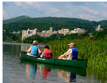
West Point is in view across the Hudson.