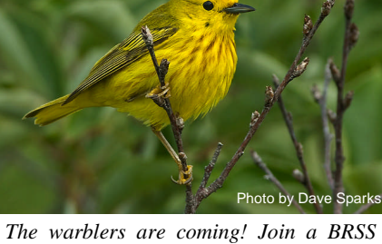
The warblers are coming! Join a BRSS field trip and we can help you ID these beautiful songsters, including this yellow warbler.

A surprise was how many interesting land birds were seen, including white-winged