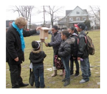
Students from Mt. Vernon's Columbus Elementary School help install the nestbox they made. We hope they will be future conservationists!

This was a year of applying the adage, "less is more." Tree swallows dominated