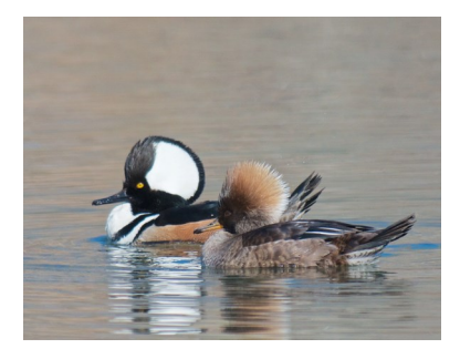
Hooded Mergansers. How about these punk hairdos?

chances are they are one of our Mergansers. There are 3 of them: Hooded is smallest, with a smooth fan-shaped crested hood. The Red-breasted has been described as having "bed-head" – you know, how your hair looks when you wake up in the morning before combing. It sticks out. The Common strikes you as very white, with a green head.