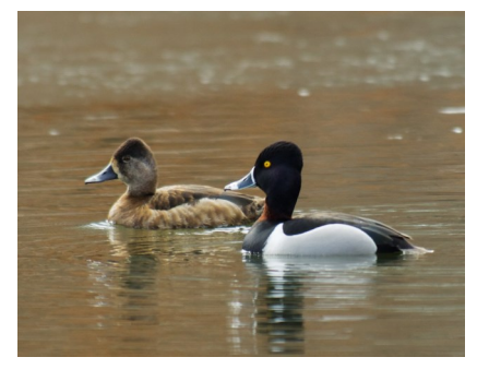
Ring-necked Ducks. Note white ring on beak.