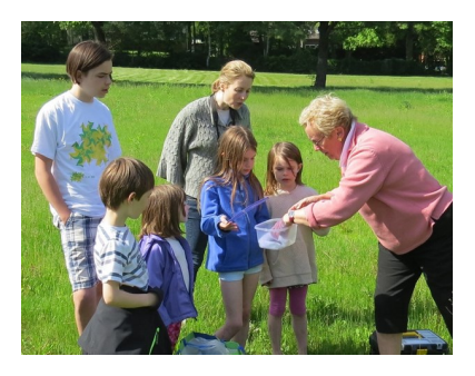
Thanks to the youth who help monitor and help with the banding.