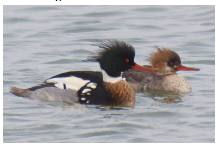
Red-breasted Mergansers. Good place to see them is at Read Wildlife Sanctuary. It straddles Playland Lake and the Long Island Sound. Thus, good place to see both sea ducks and lake ducks.