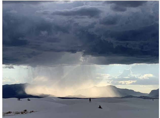
White Sands

Woodhouse Scrub Jays screeched in the trees; a Spotted Towhee hopped down the trail. We lingered, as the main sight at