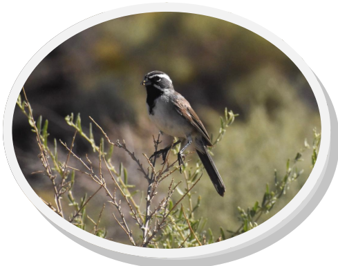
Black-throated Sparrow