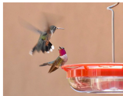
Broad-tailed and Rufous Hummingbirds. Photo by Violet Brill

View from the Rio Grande Gorge Bridge Photo by Violet Brill