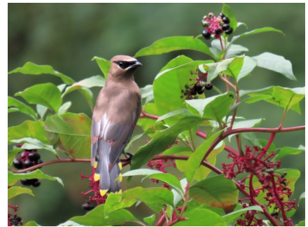
While everyone might not let native pokeweed invade their garden, I did and was rewarded with Cedar Waxwings. Go native!

If you want to learn more about the benefits of natives, and some recommendations of what to plant, sign up