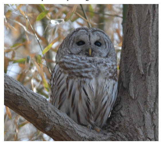
Barred Owl at Read Sanctuary

On a late winter day 15 participants saw 40 species of birds. Some of the highlights were a Barred Owl, three male Wood Ducks, and some Horned Grebes on the sound side at Read. Reported by Doug Bloom.