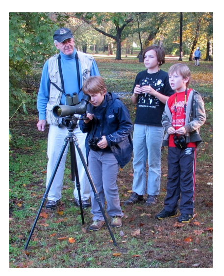
Youth Birders spot a Wood Duck on field trip to Crestwood Lake.

ticipate in our Youth Birding events accompanied by an Adult. Binoculars and Field Guides are available to participants during the walks.