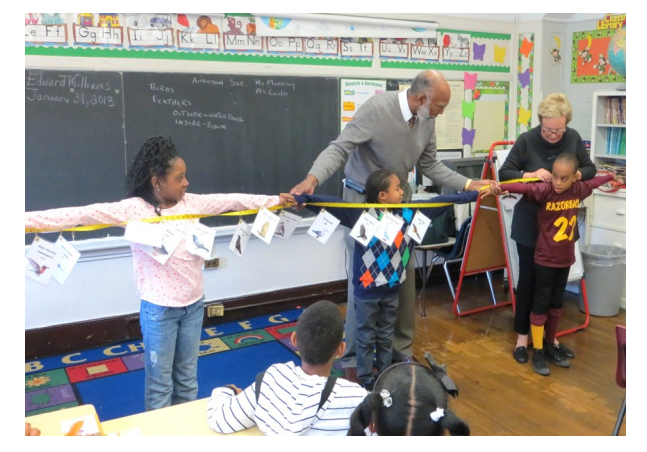
How many 2<sup>nd</sup> graders does it take to have a wing span of a Bald Eagle?