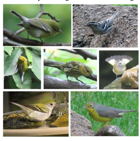
Can you ID the warblers? – all my pictures from this day. Answers on Page 6

As you readers are Audubon members and most likely birders already, I'm preaching to the choir. But I just needed to share my extraordinary morning. Thanks for listening.