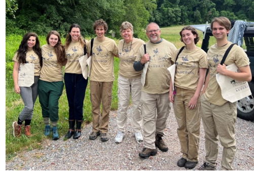
Our Eastern Bluebird Project reaches a lot of people. Here is A little worri- the Stone Barns crew including their summer interns

tery, which was its own hot spot until last year when it inexplicably got zero, was back in business with one nesting pair.