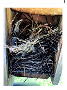
Nest of sticks

have earned it status of least concern for the future of the species. Good news for fans of the perky, scolding, sometimes malicious, but loveable House Wren.