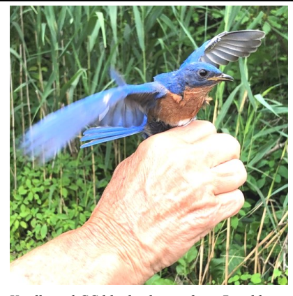
Knollwood CC bluebird one of two 7-yr bluebirds we recaptured this year. Bird Banding Lab's oldest banded bird is 10 yr, 8 mo. We are going for that record.

Highlights included recapturing two 7year birds (our oldest ever), a success-