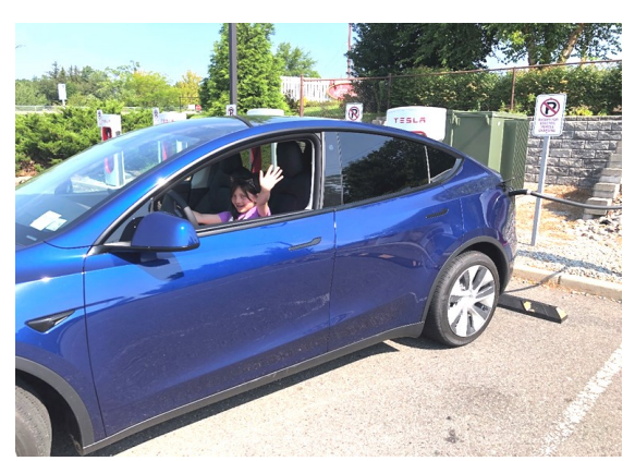
Charging into the future for my grandchildren!

Price is one of the major reasons people don't go electric. They do cost more than a comparable car, but you