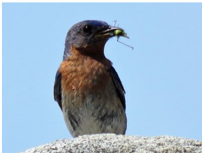
A male bluebird at Apawamis Country Club brings a tasty insect to its nestlings. Happy to see it isn't a pillbug, which was blamed last year for spreading the parasite.

While I didn’t see a single bluebird on my own golf course – the place where this whole bluebird project got started, I remain hopeful that next year the bluebird of happiness will return!