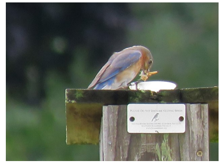
We helped a “single mom” feed her hungry nestlings by supplying mealy worms daily. Three fledged successfully.