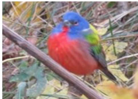
Painted Bunting should be in Florida