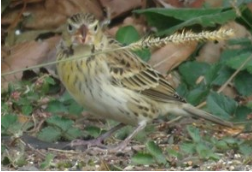
Dickcissel should be in Venezuela

makes it a 1 st winter bird. Interestingly, all my bird guides say it often hangs out with House Sparrows, so at least it's learned that much, if not its way south.