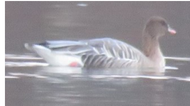
Pink-footed Goose should be in Great Britain

The lake is covered with hundreds of Canada Geese. This is another needle in a haystack. No time for our Sesame Street routine to scan them all. We race along. Just as the sun drops behind the trees, we spot some birders who help us spot the goose. Victory! Our 4 th lifer in one day!