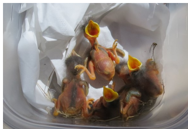
These 5 nestlings were starving and would die if not adopted.

However, we were in the middle of the nesting season. Most first