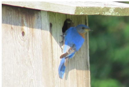
Dad of the Year!

the adoptees was discovered dead. Since it had been banded, including being weighed, our records showed that it was the "runt" of the brood. So nature was taking its course