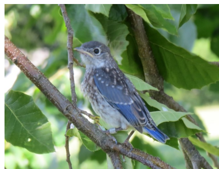
Rescued bluebird successfully fledged. Dad was still looking after it.

Another big worry came when only the male was observed feeding the nestlings during the entire last week before they fledged. However, he was up for the challenge, making non-stop deliveries of insects to his large family. On the day they fledged, I arrived to check to see how things were. An empty nestbox proved that all had fledged successfully. But, Dad was still on the job. He dive-bombed me continuously. I soon realized that the fledglings were in the nearest tree. I was thrilled to get a picture and close view of one of them, but then I left quickly so the Dad could continue his job of feeding and looking after his brood for the next several weeks until they are totally independent.